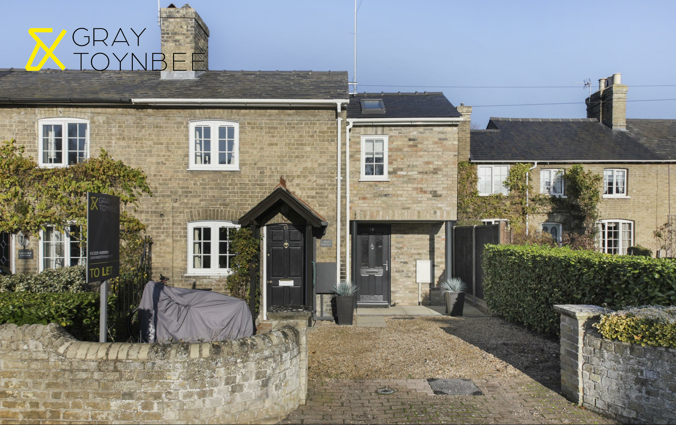
Rose Cottage, 15 Bury Road, Stapleford, CB22 5BP £1,500 Per month