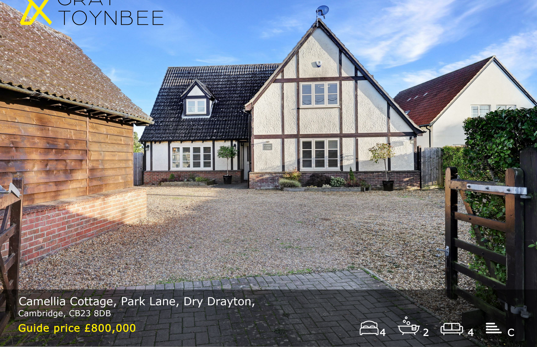
Camellia Cottage, Park Lane, Dry Drayton, Cambridge, CB23 8DB