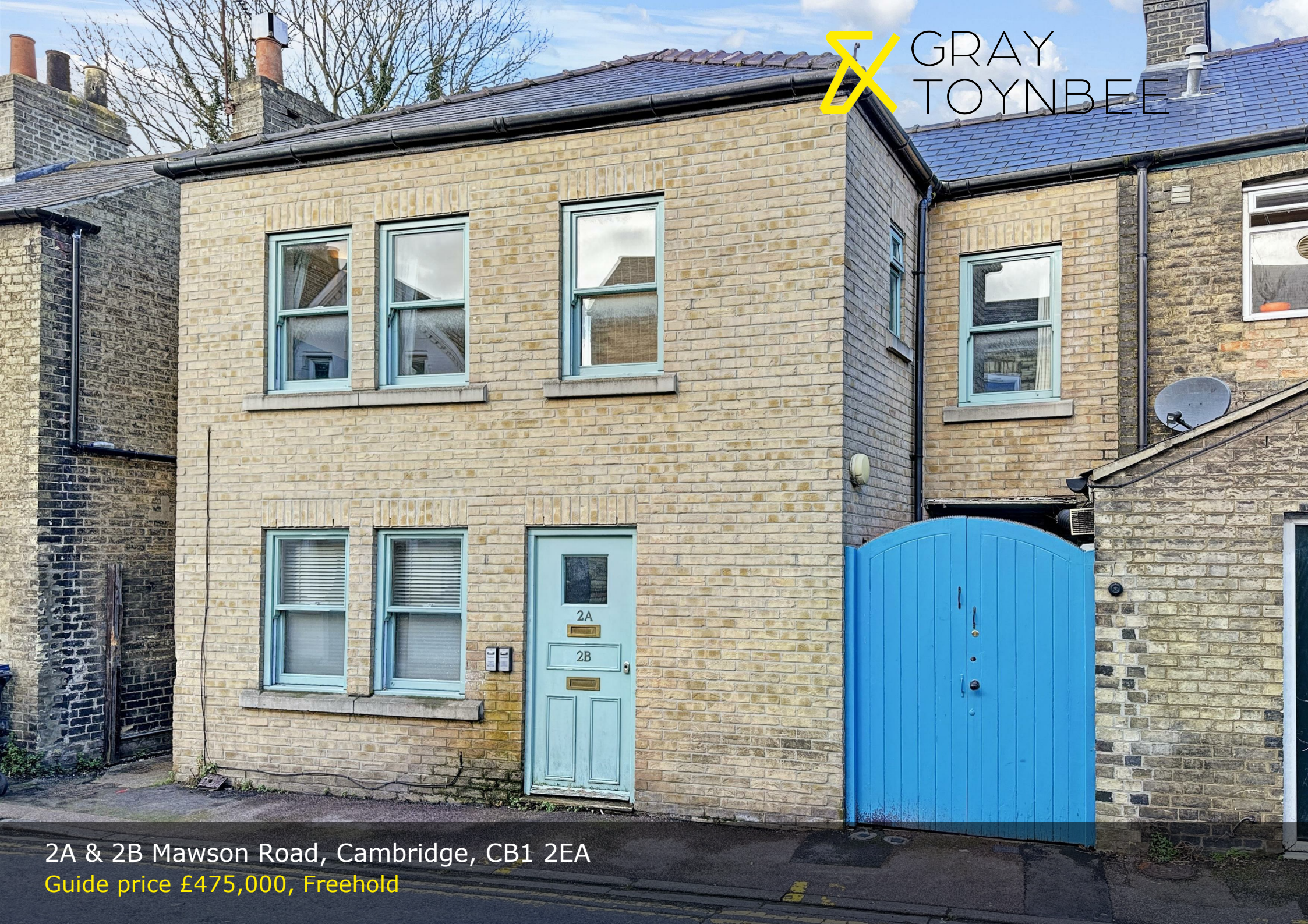
2A & 2B Mawson Road, Cambridge, CB1 2EA Guide price £475,000, Freehold