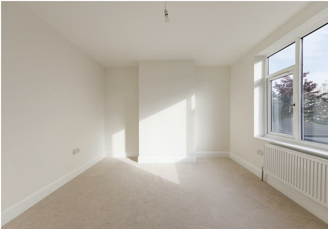
Bedroom 12'11" x 11'7"