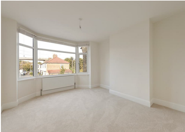
Reception Room 13'3" x 13'1"