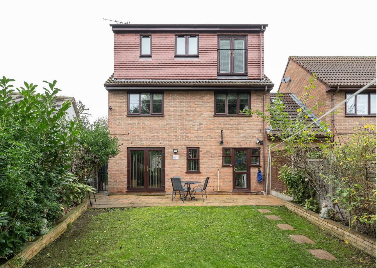
Garden 28'0" x 32'8"