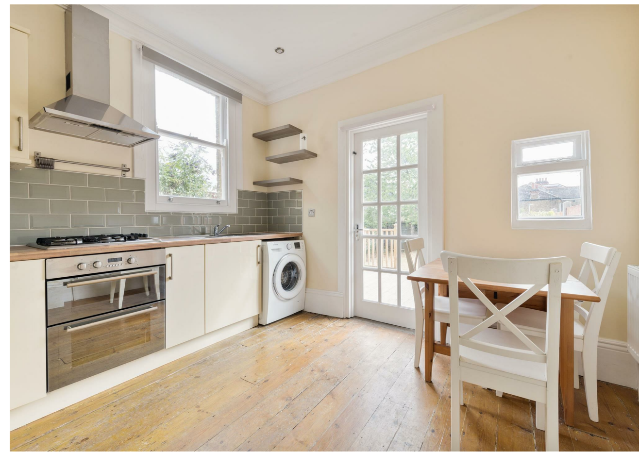
FOLLOW US → @STOWBROTHERS STOWBROTHERS.COM