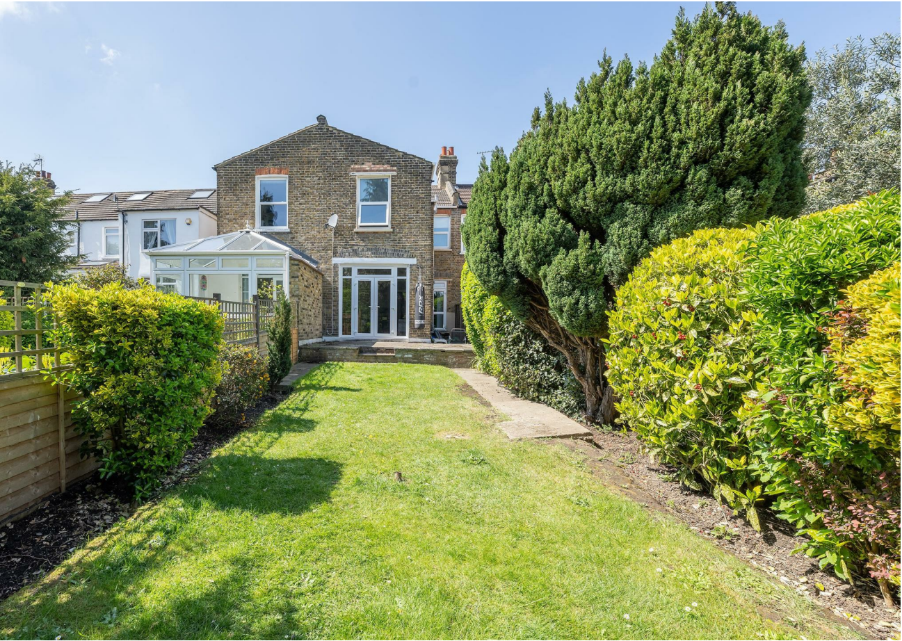
Garden 66'1" x 17'8"