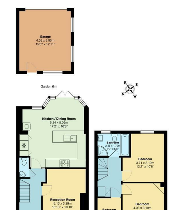
Total Area: 87.1 m² ... 937 ft² (excluding garage)