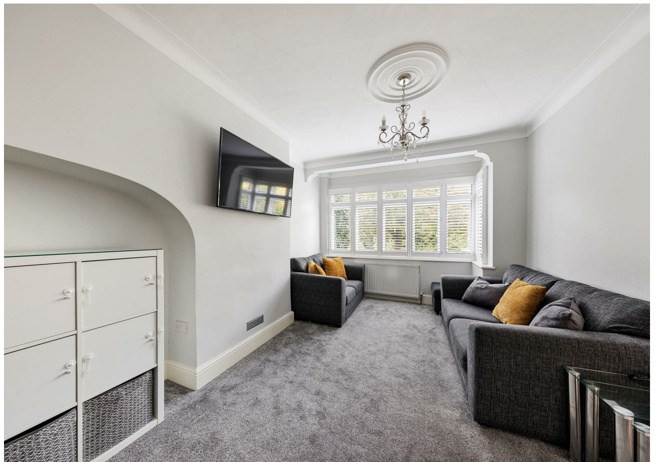
FOLLOW US → @STOWBROTHERS STOWBROTHERS.COM