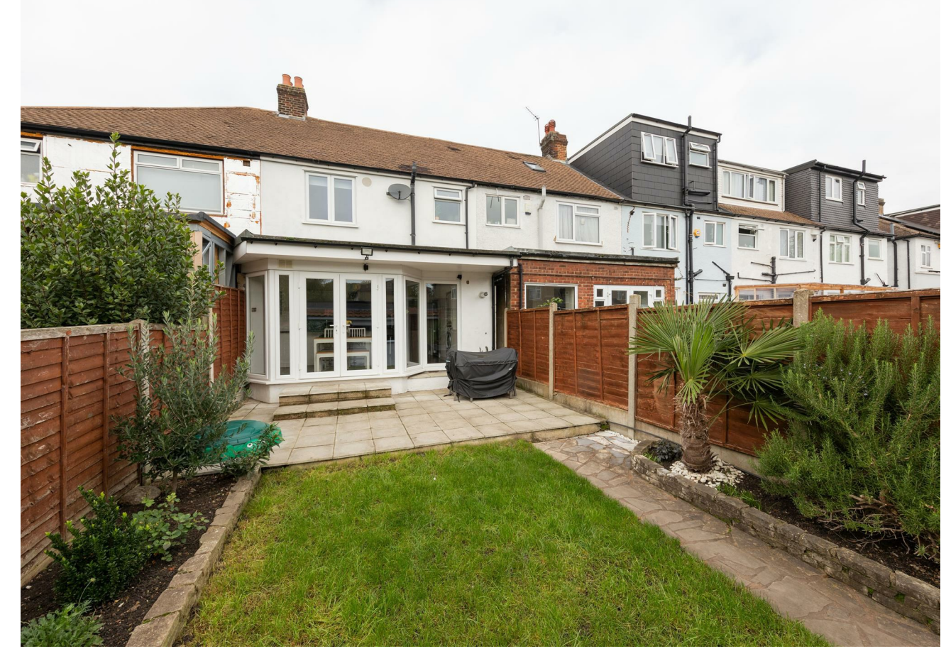
FOLLOW US → @STOWBROTHERS STOWBROTHERS.COM