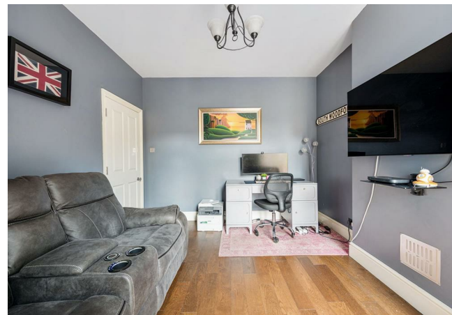
Reception Room 14'11" x 12'7"