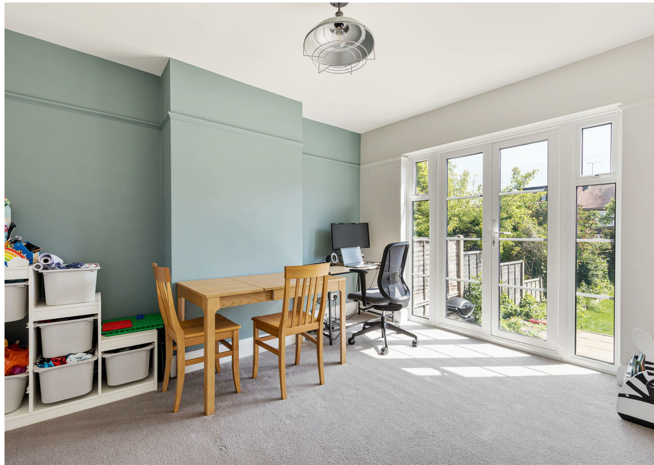
Reception One 14'11" x 12'6"