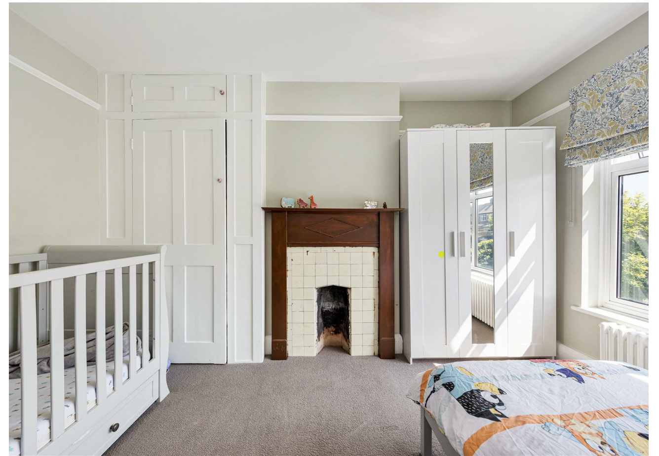
Bedroom Three 8'5" x 6'4"