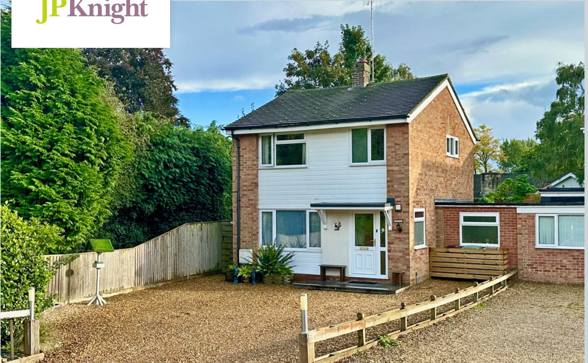
Chambrai Close, Appleford OX14 4NT