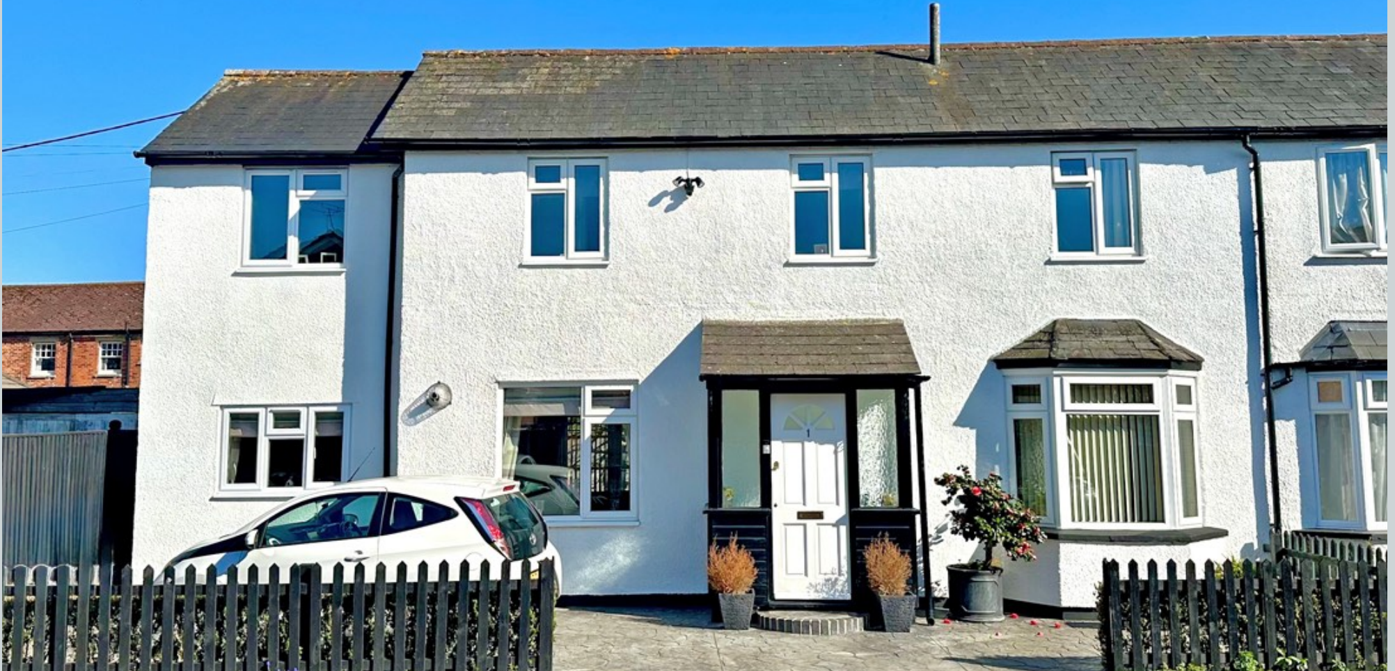
1 Compton Terrace, Wallingford OX10 0JU