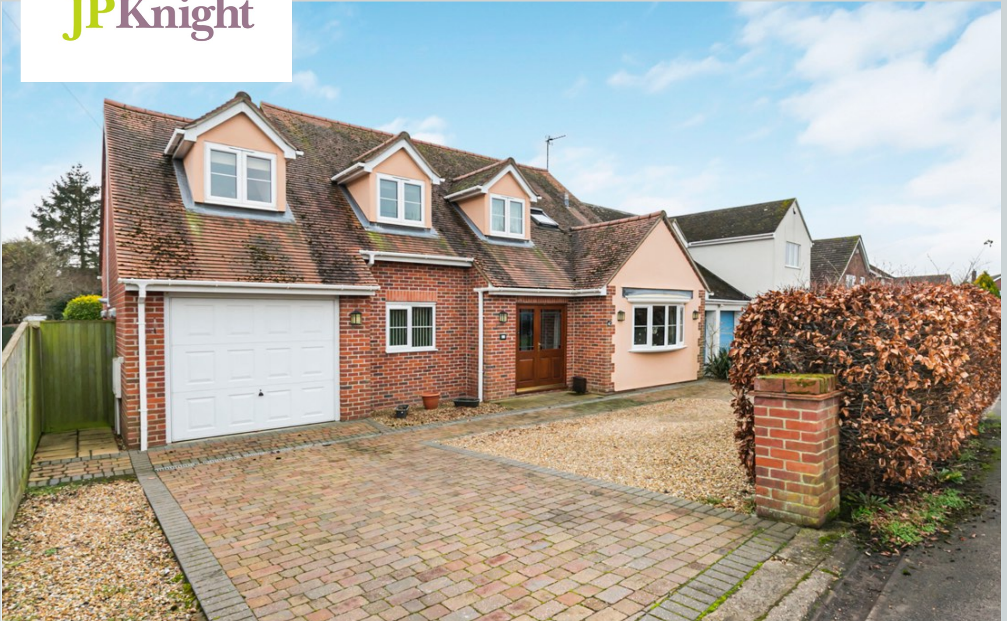
6 Wormald Road, Wallingford OX10 9BE