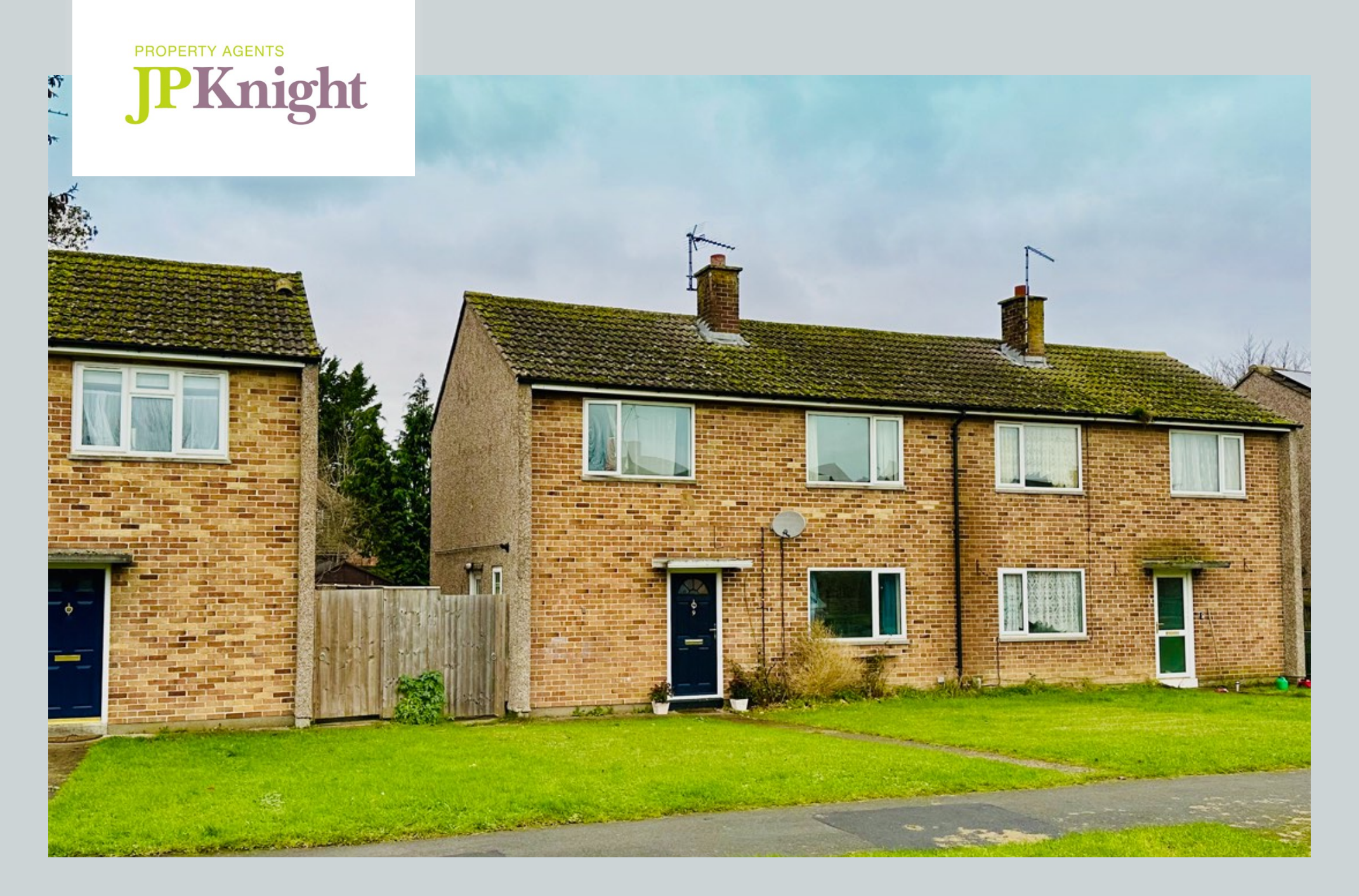
Celsea Place, Cholsey, OX10 9QW