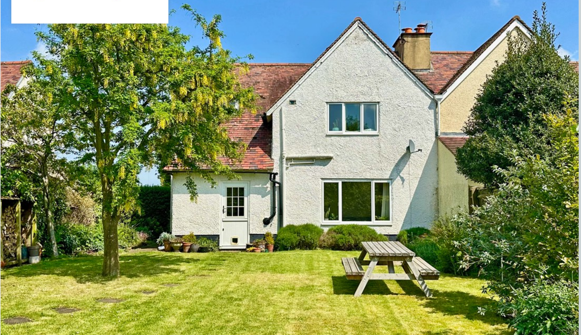
Meadside, Dorchester on Thames OX10 7JX