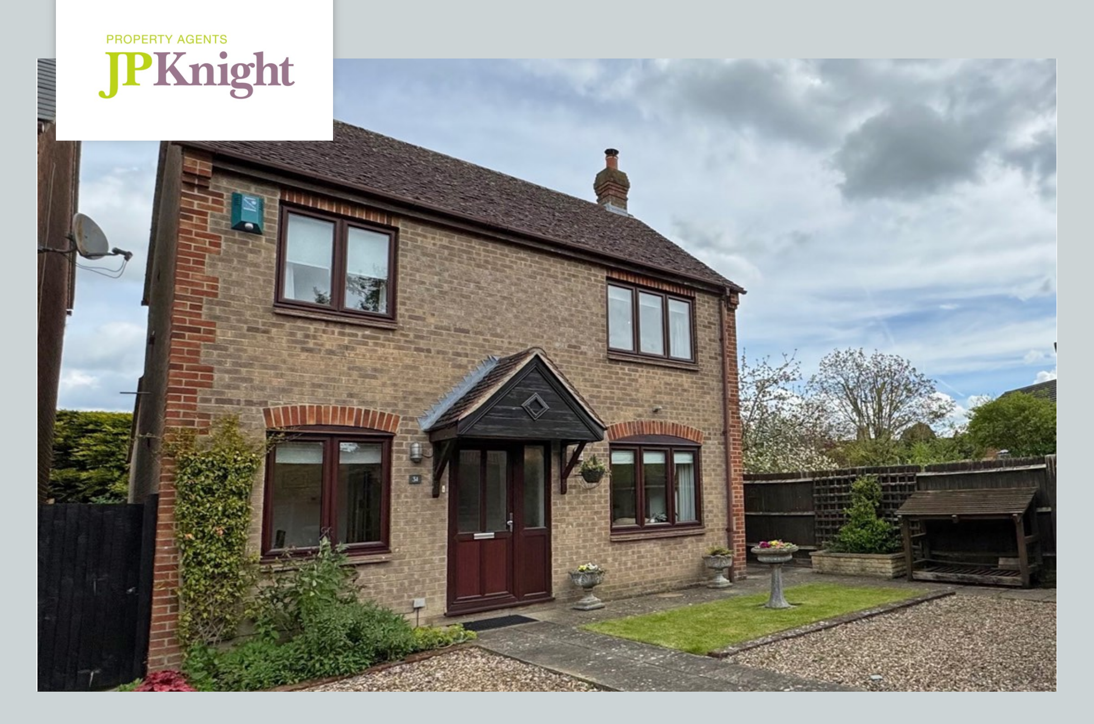
Robert Sparrow Gardens, Crowmarsh Gifford OX10 8DQ