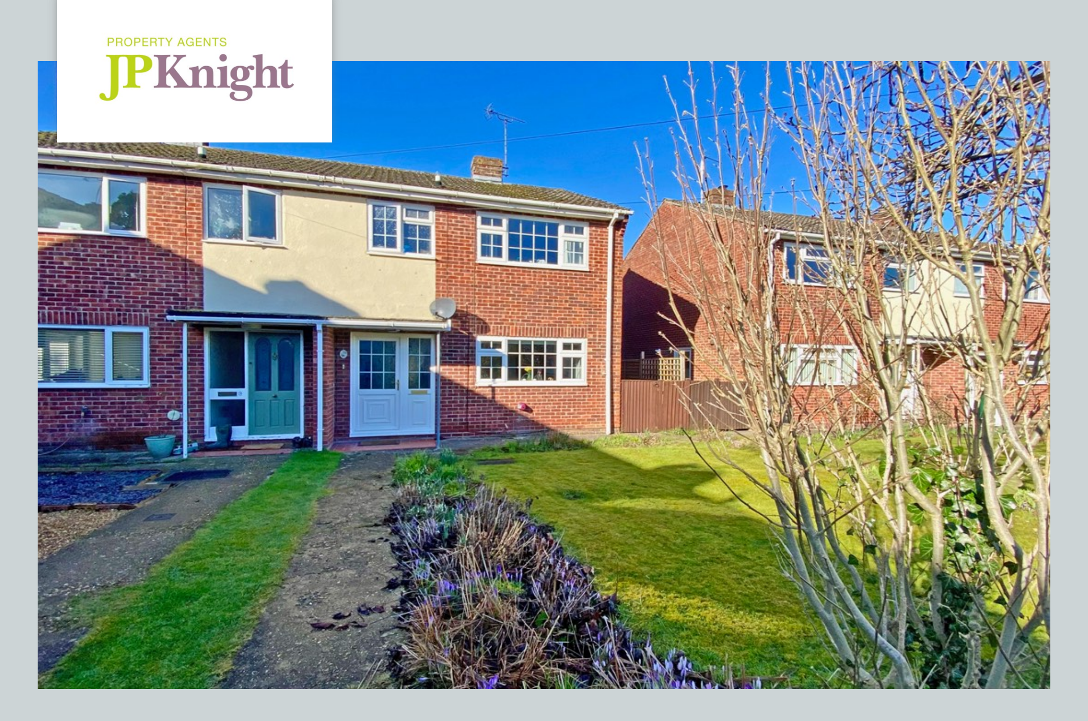
The Rowans, Cholsey OX10 9LN