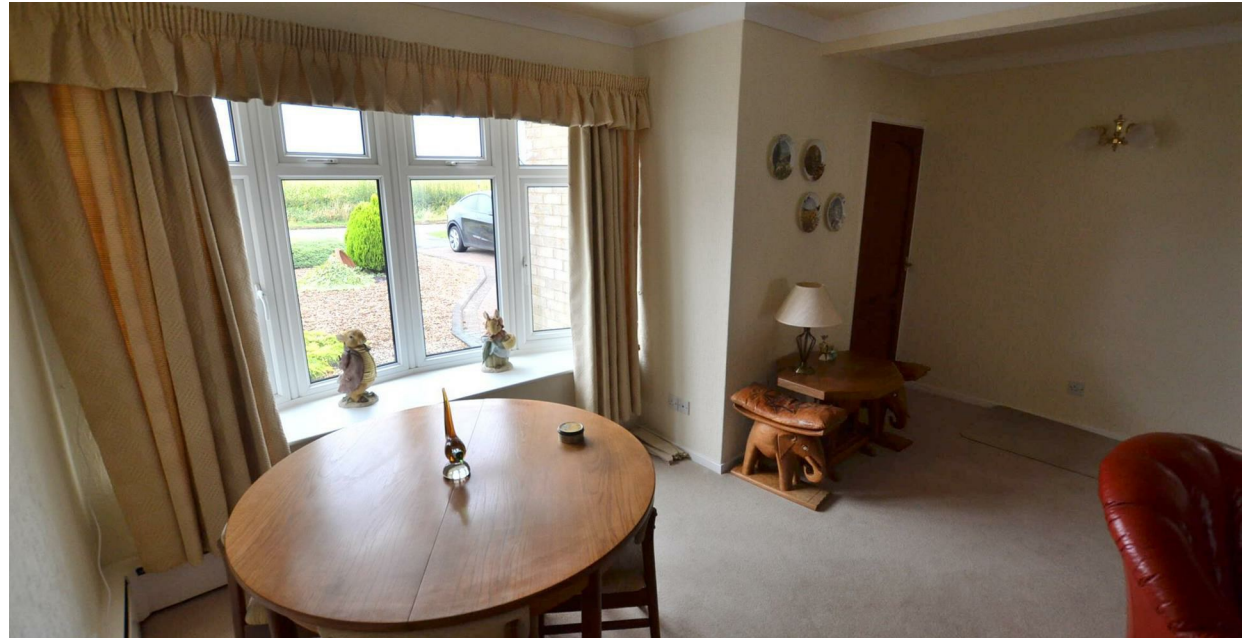
184 Broome Lane, East Goscote, Leicestershire, LE7 3WQ