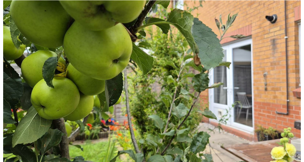
2 Bond Close, Loughborough, Leicestershire, LE11 2LQ