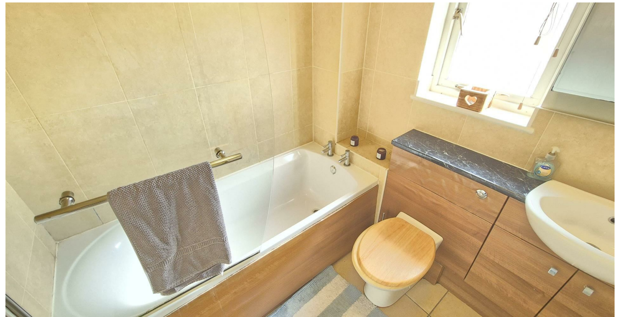
2 Bond Close, Loughborough, Leicestershire, LE11 2LQ