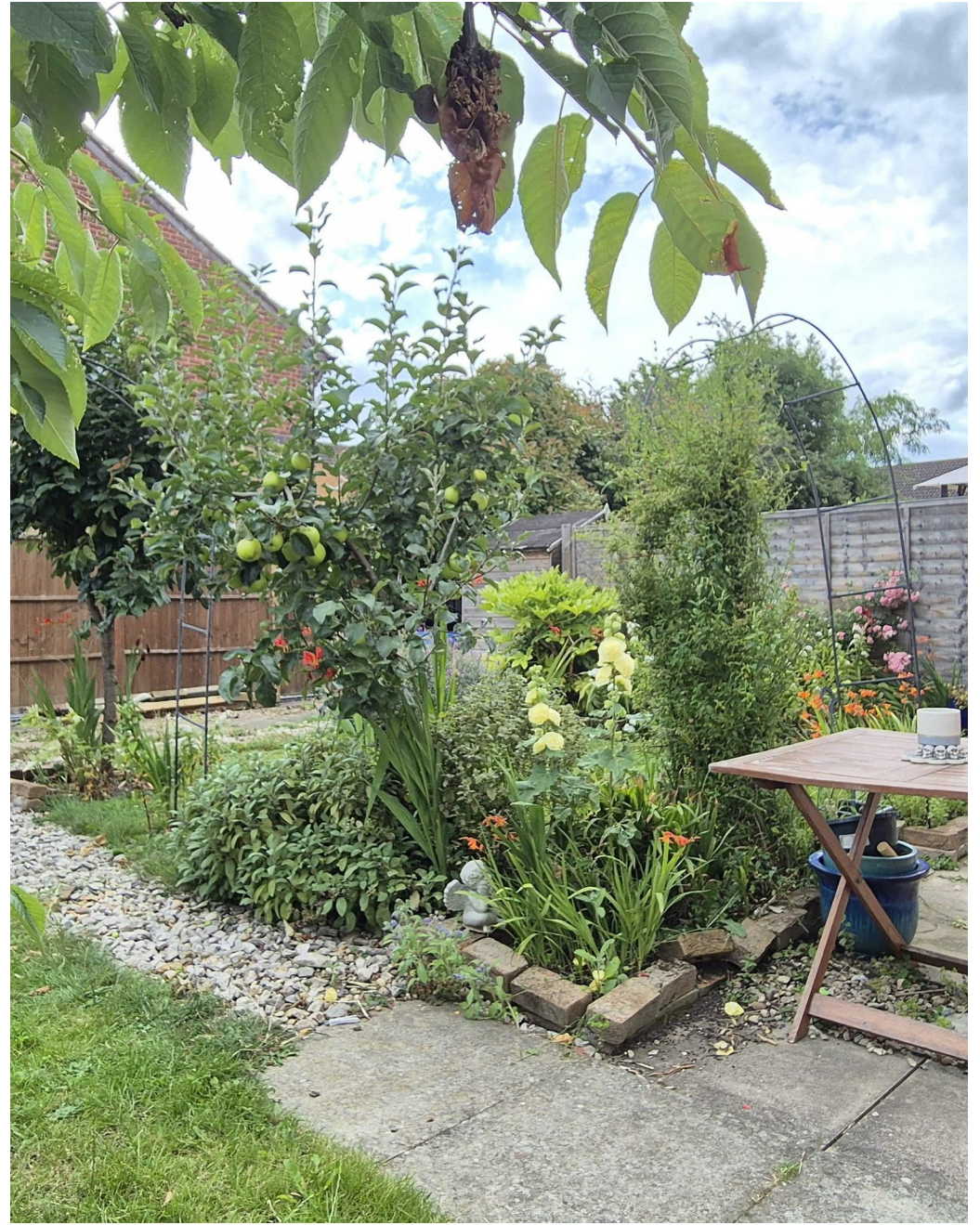
2 Bond Close, Loughborough, Leicestershire, LE11 2LQ