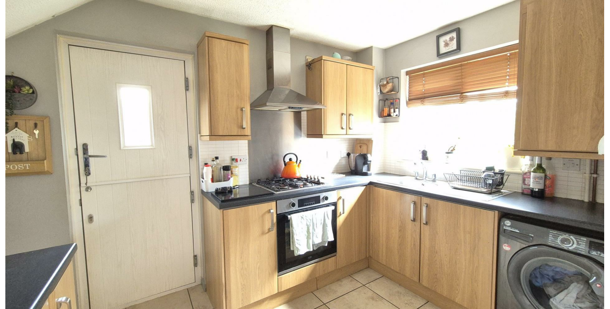
2 Bond Close, Loughborough, Leicestershire, LE11 2LQ