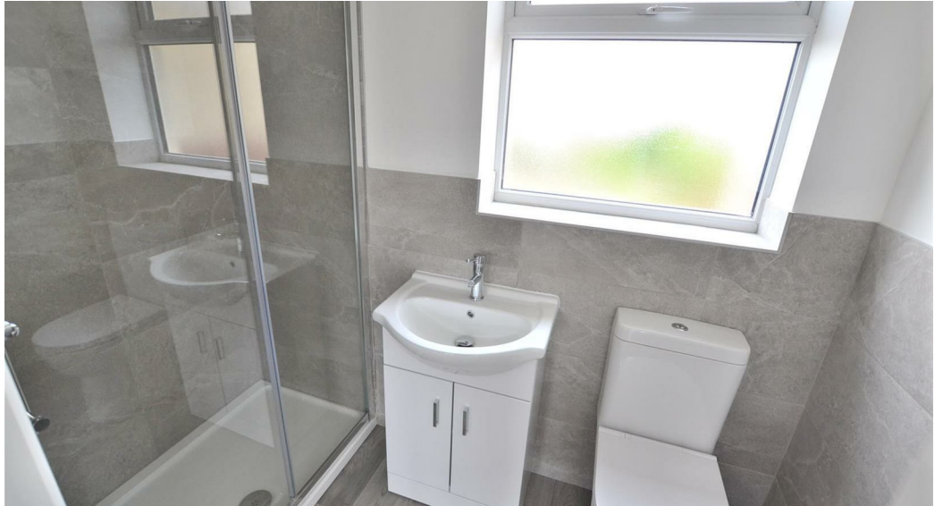
1c Greedon Rise, Sileby, Leicestershire, LE12 7TE