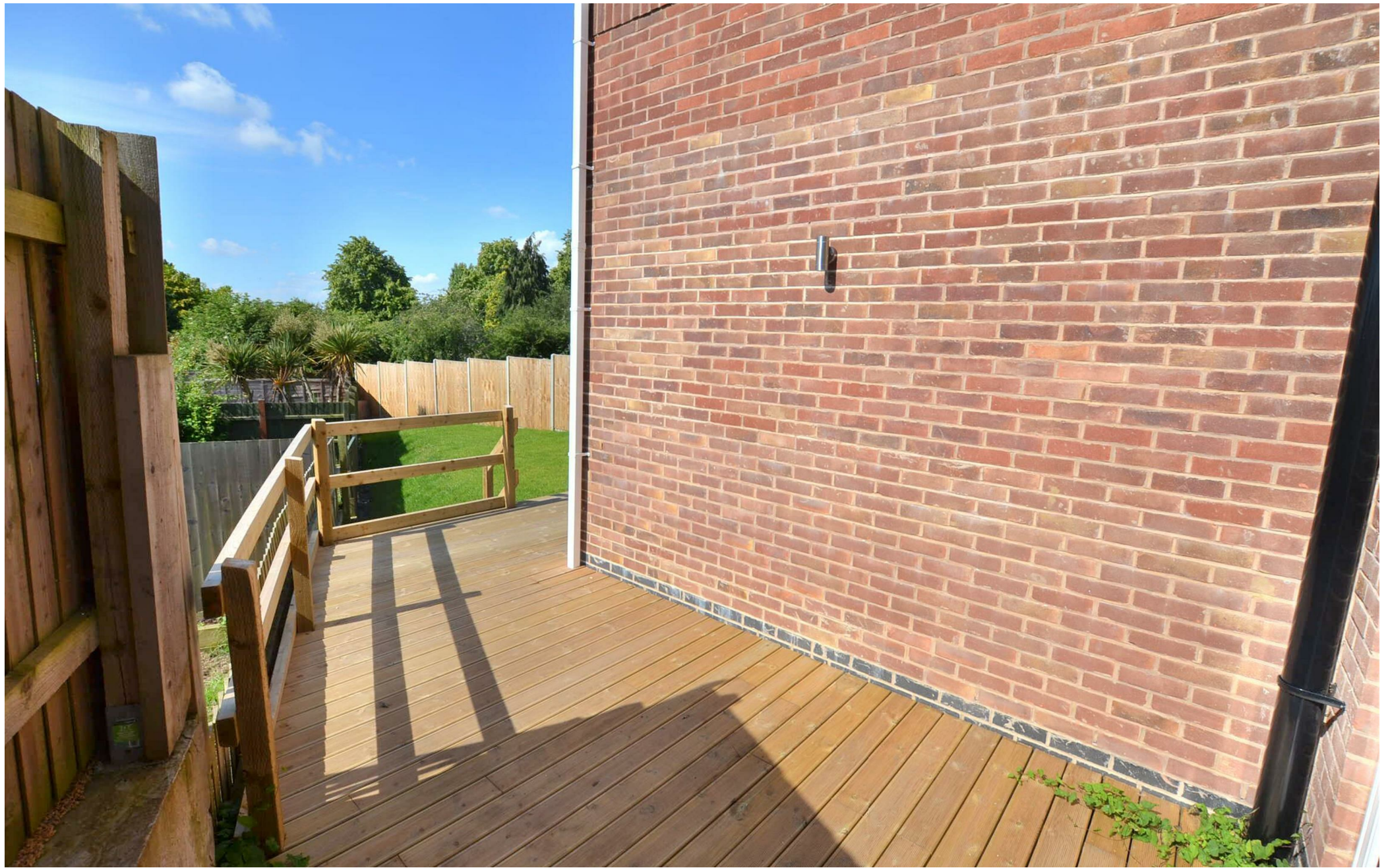
1c Greedon Rise, Sileby, Leicestershire, LE12 7TE