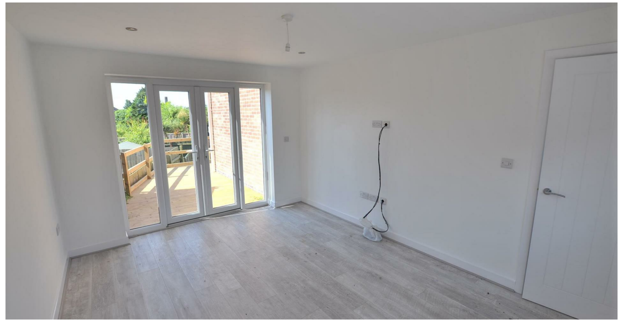
1c Greedon Rise, Sileby, Leicestershire, LE12 7TE