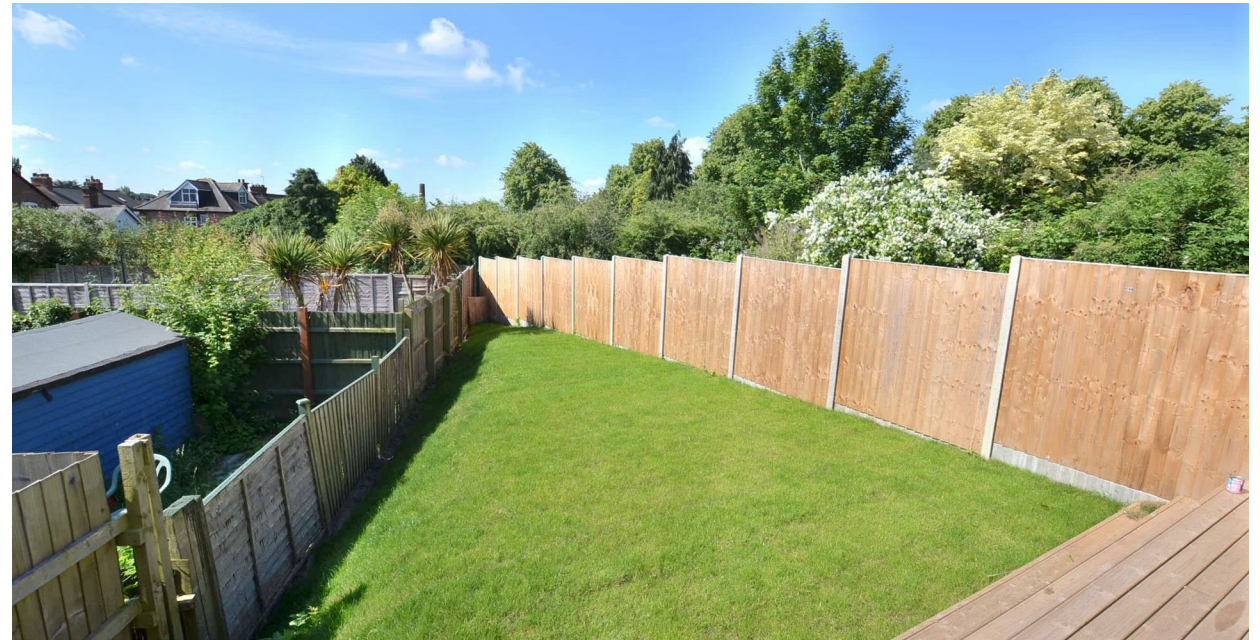
1c Greedon Rise, Sileby, Leicestershire, LE12 7TE