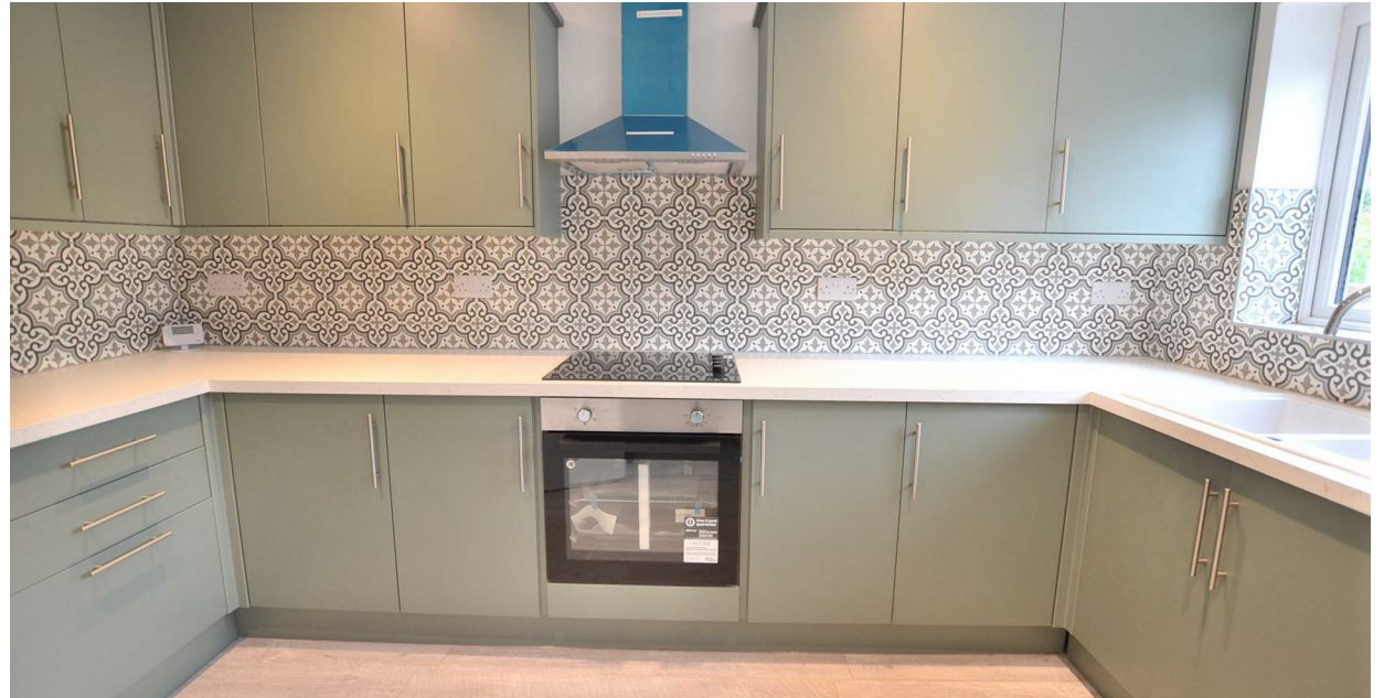
1c Greedon Rise, Sileby, Leicestershire, LE12 7TE