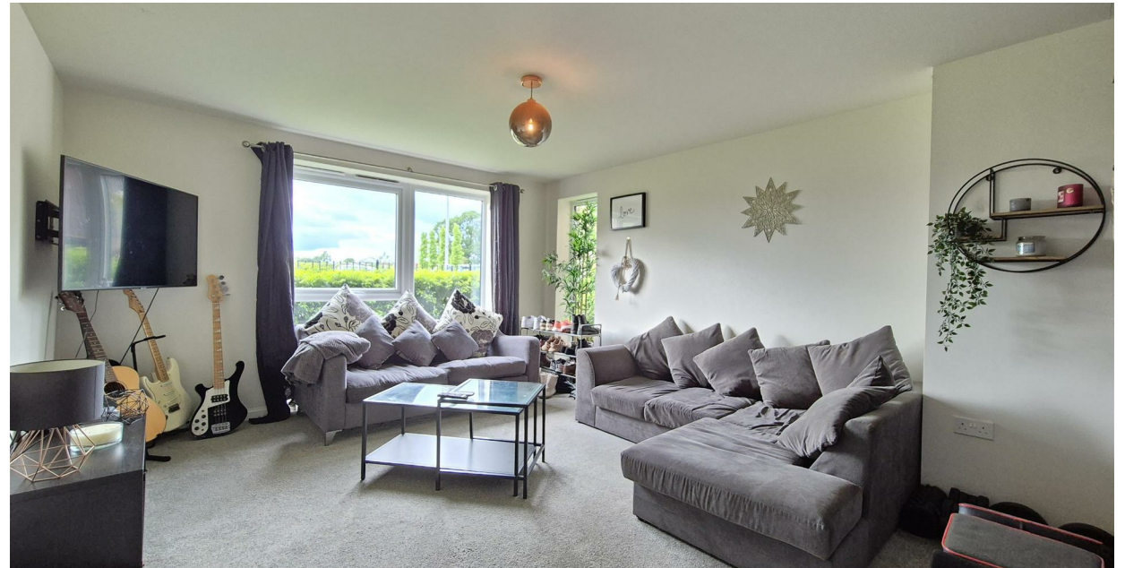
78 Tay Road, New Lubbethorpe, Leicester, Leicestershire, LE19 4BF