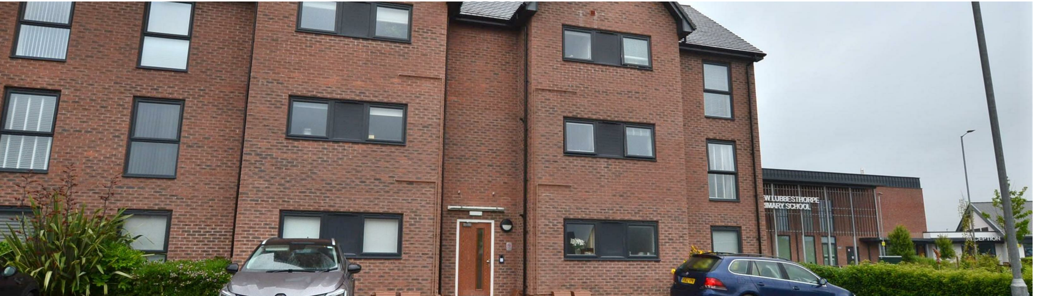
78 Tay Road, New Lubbethorpe, Leicester, Leicestershire, LE19 4BF