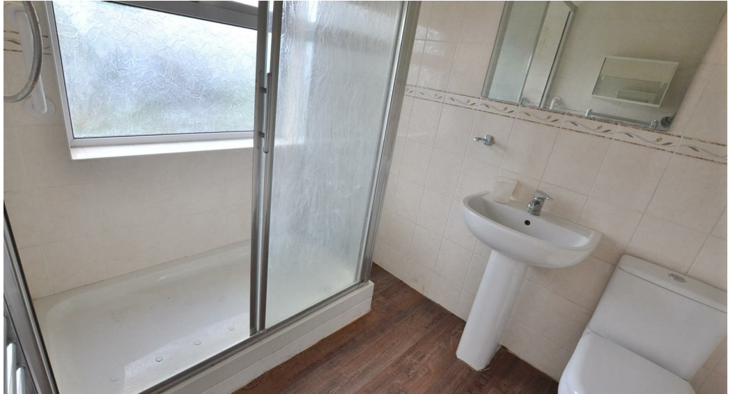
52 Woodgate Drive, Birstall, Leicestershire, LE4 3JW