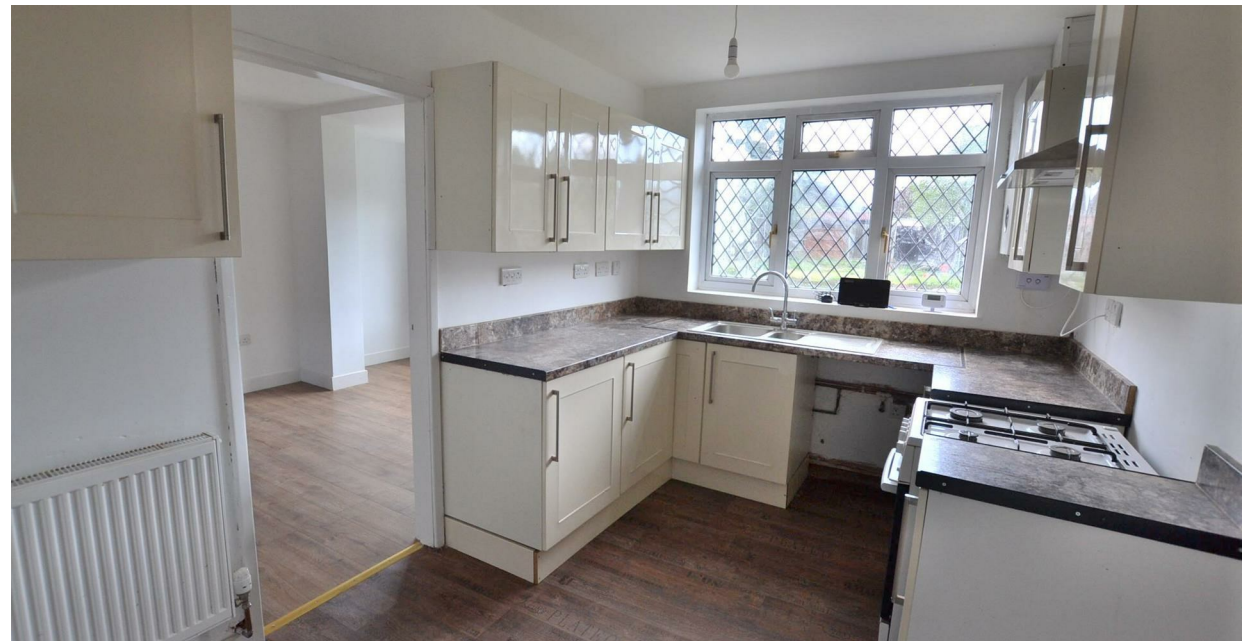
52 Woodgate Drive, Birstall, Leicestershire, LE4 3JW