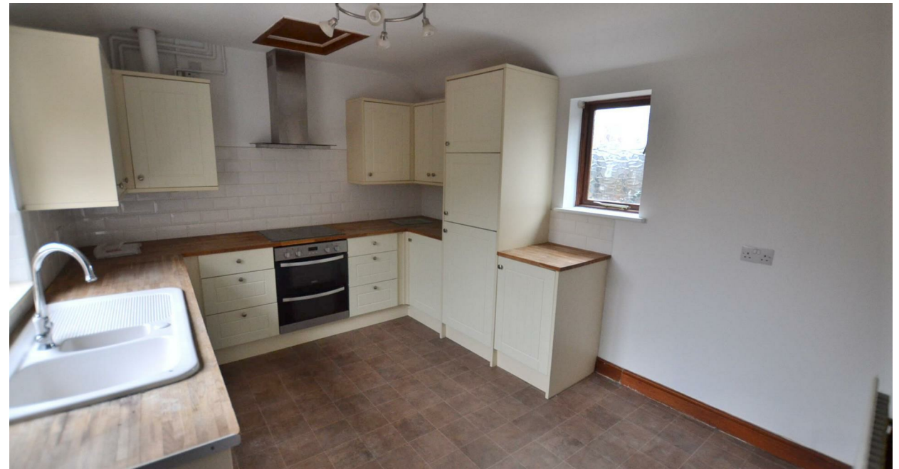
Jasmine Cottage, 39 The Banks, Sileby, Leicestershire, LE12 7RD