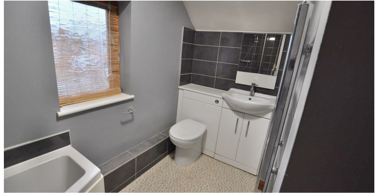
Jasmine Cottage, 39 The Banks, Sileby, Leicestershire, LE12 7RD