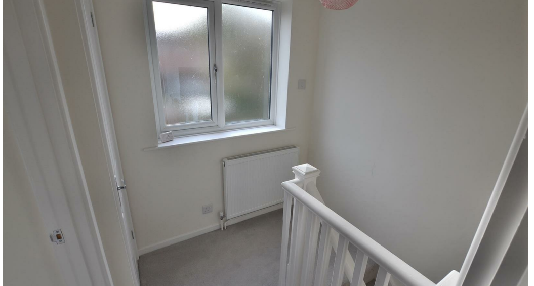
4 The Banks, Sileby, Leicestershire, LE12 7RE