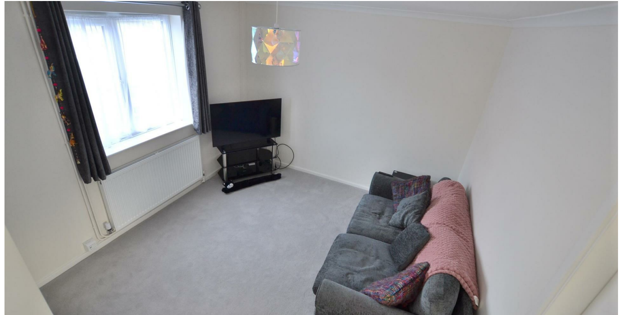
4 The Banks, Sileby, Leicestershire, LE12 7RE