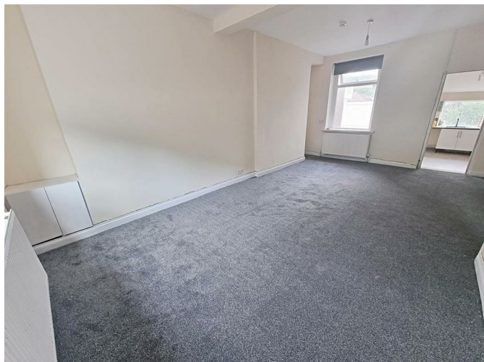
Lounge 21'0" x 11'6" (6.41 x 3.53)