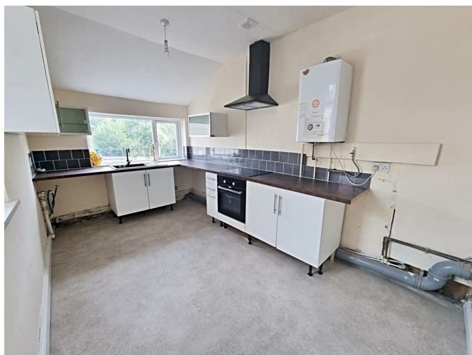
Kitchen/Breakfast Room 14'7" x 8'6" (4.45 x 2.60)