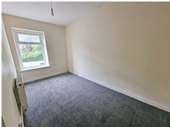
Bedroom 1 13'9" x 7'4" (4.20 x 2.25)