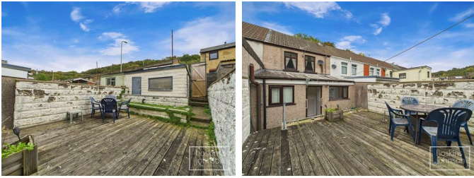
Decked rear garden with lane access and storage. Plot of land opposite the house ideal for off road parking or construction of a garage (subject to permission being obtained).