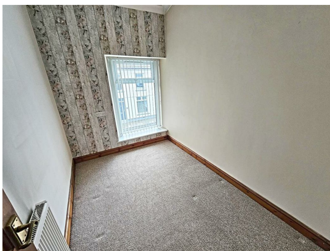
Bedroom 3 9'3" x 6'6" (2.82 x 2.00)