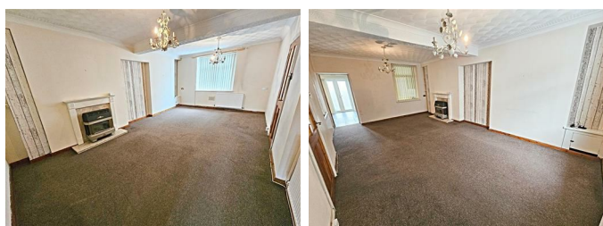
Lounge 20'9" x 11'11" (6.35 x 3.65)