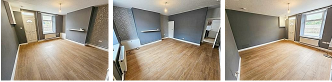
Lounge 13'5" x 12'9" (4.11 x 3.90)