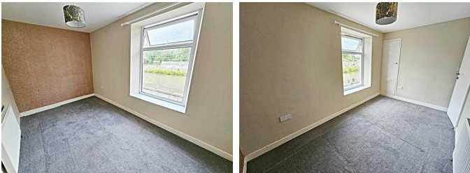
Bedroom 2 9'6" x 8'5" max (2.90 x 2.57 max)