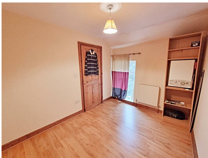
Bedroom 2 10'6" x 8'2" (3.21 x 2.50)