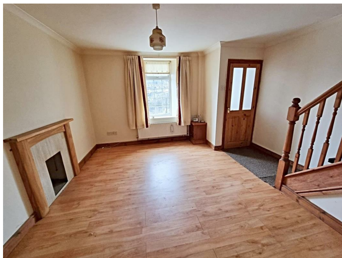
Lounge 13'5" x 12'8" (4.09 x 3.88)