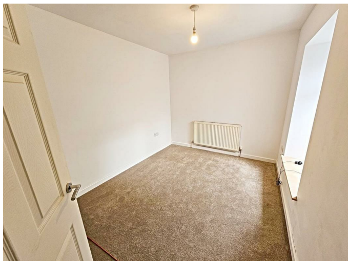
Bedroom 2 11'5" x 8'6" (3.50 x 2.60)