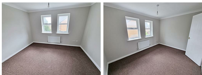
Bedroom1 11'10" x 9'1" (3.60 x 2.76)