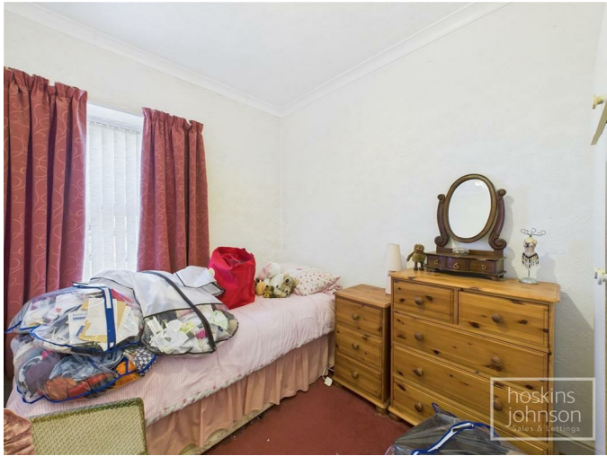
Bedroom 4 9'10" x 7'2" (3.00 x 2.20)

Double glazed window to front, radiator, coved ceiling.