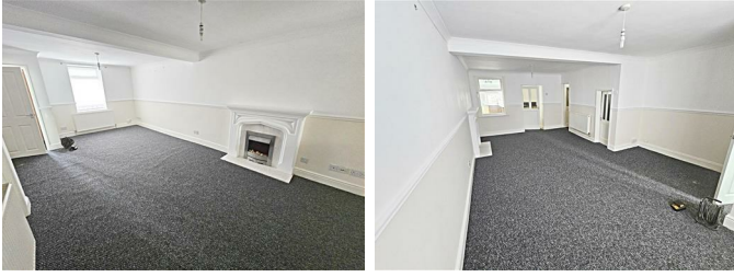
Lounge 21'0" x 13'9" max (6.42 x 4.20 max)