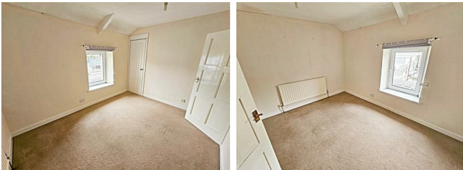
Bedroom 1 11'3" x 9'2" (3.44 x 2.81)