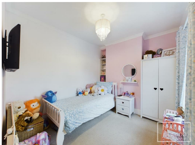
Bedroom 2 9'0" x 9'0" (2.75 x 2.75)