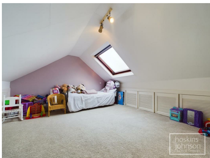
Second Floor Attic Room 15'3" x 11'5" (4.65 x 3.50)

An excellent size attic room suitable for a variety uses, skylight to rear and eaves storage.