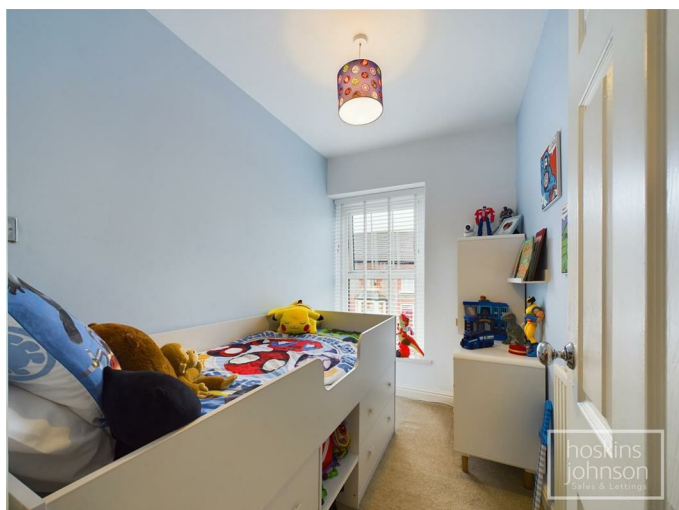
Bedroom 3 8'9" x 6'2" (2.67 x 1.89)

Double glazed window to front, radiator.