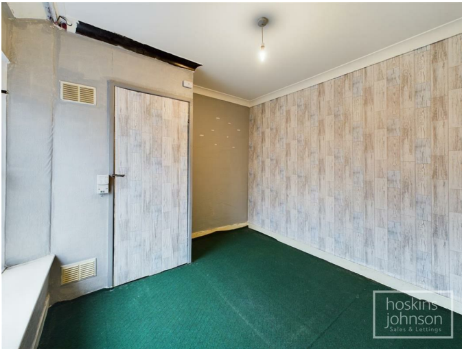
Bedroom 2 9'3" x 9'0" (2.83 x 2.76)

Double glazed window to rear, coved ceiling, airing cupboard with gas combination boiler.