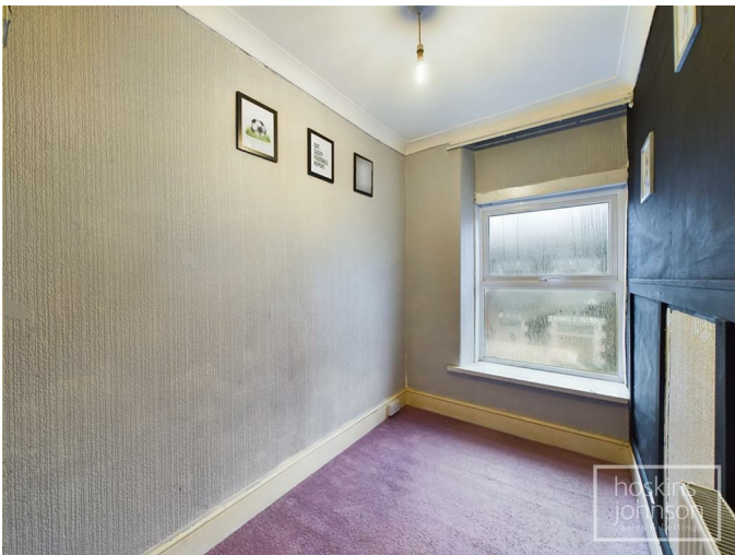
Bedroom 3 8'2" x 5'4" (2.49 x 1.64)

Double glazed window to front, radiator.