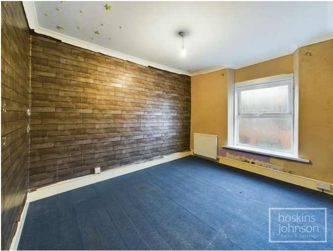
Bedroom 1 11'5" x 9'3" (3.49 x 2.82)

Double glazed window to front, radiator, coved ceiling.