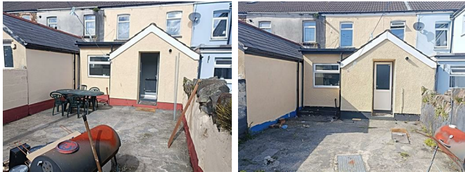
Concreted rear yard with lane access.