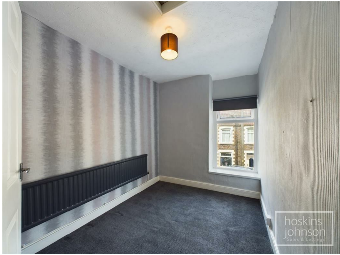
Double glazed window to front, radiator.