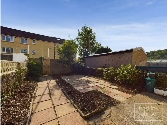
Paved rear garden with barked borders and lane access.