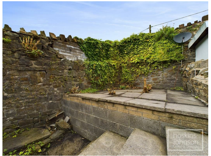
Paved yard with terraced, paved garden.