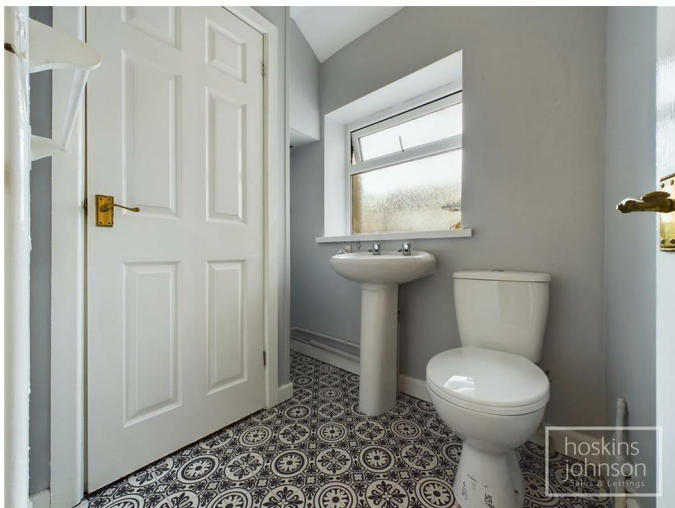
WC, wash hand basin, cupboard with wall mounted gas combination boiler, double glazed window to side.