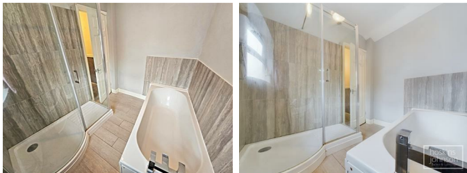
White suite comprising panelled bath, walk in shower, part tiled walls, radiator, double glazed window to side.