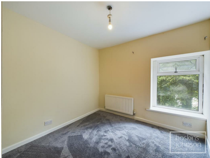
Double glazed window to front, radiator.