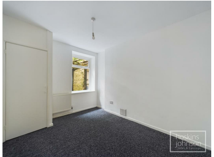
Double glazed window to rear, radiator.