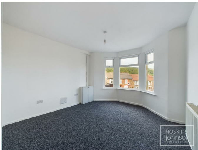
Double glazed bay window to front, radiator.