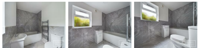
New three piece suite in white and comprising panelled bath with shower mixer taps, wc, wash hand basin, part tiled walls, tiled floor, chrome heated towel rail, double glazed window to rear.