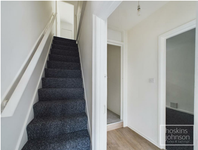
Half glazed door, radiator, laminated wood flooring, staircase to first floor.