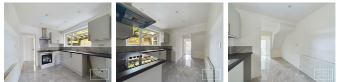
Newly fitted with a range of grey gloss base and wall cupboards with tiled splash backs, stainless steel sink unit, ceramic hob and electric oven with extractor hood above, space for washing machine, radiator, ceiling spotlights, tiled floor, space for table and chairs, double glazed window to side.