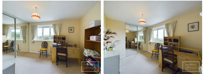
Bedroom 4 11'8" x 8'6" (3.56 x 2.60)

Double glazed window to front, radiator, built in wardrobe.