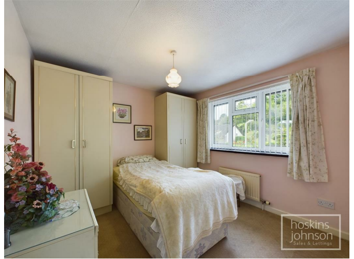
Bedroom 3 9'9" x 9'8" (2.98 x 2.96)

Double glazed window to front, radiator.