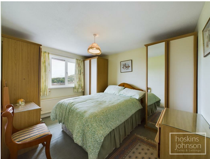
Bedroom 2 11'9" x 9'8" (3.60 x 2.97)

Double glazed window to front, radiator.