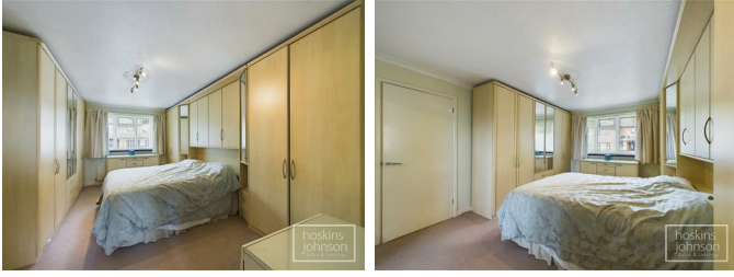
Bedroom 1 15'5" x 12'2" (4.71 x 3.73)

Double glazed window to front, radiator, coved ceiling.