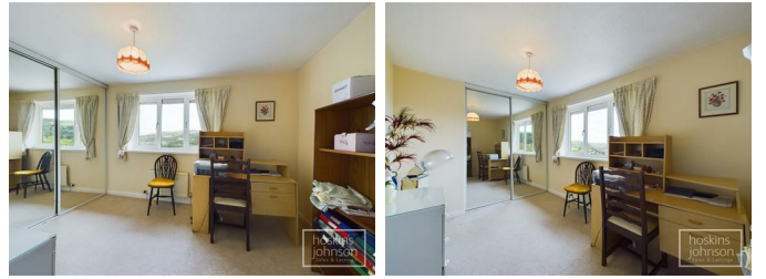
Bedroom 4 11'8" x 8'6" (3.56 x 2.60)

Double glazed window to front, radiator, built in wardrobe.