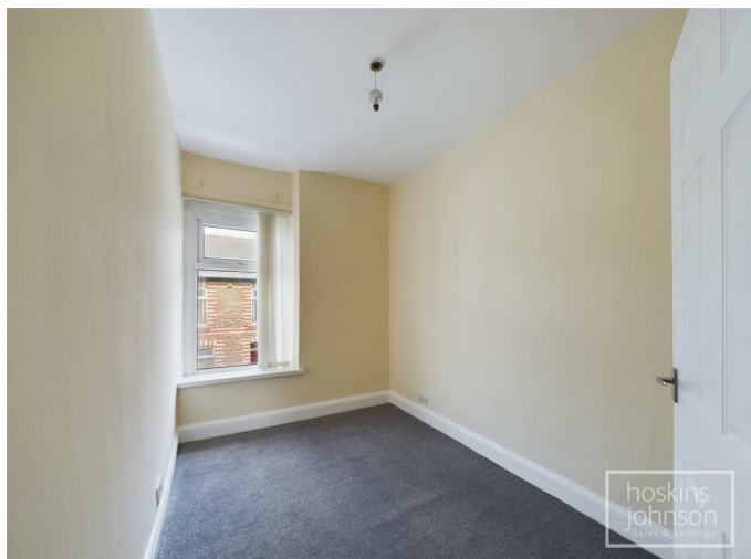
Double glazed window to front, radiator.