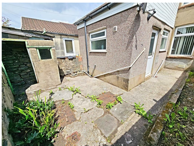
Rear courtyard garden with rear access.