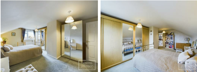
Bedroom 2 18'5" x 11'8" (5.62 x 3.56)

Double glazed window to front, radiator.