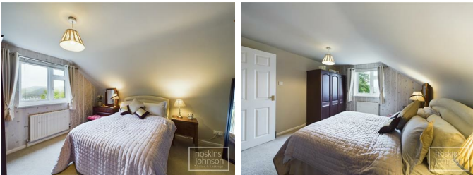
Bedroom 4 14'0" x 11'4" (4.27 x 3.47)

Double glazed window to front, radiator, walk in storage room.