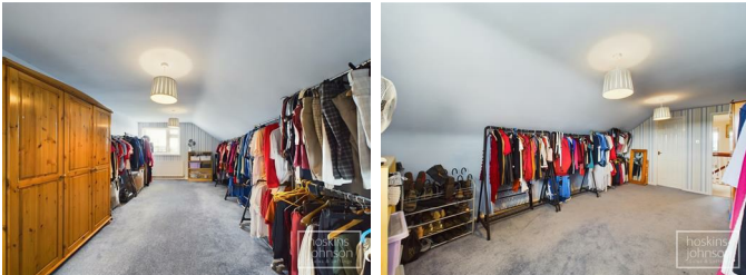
Bedroom 3 18'6" x 11'2" (5.64 x 3.42)

Double glazed window to front, radiator, walk in storage room.