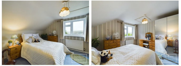
Bedroom 5 11'3" x 10'3" (3.43 x 3.13)