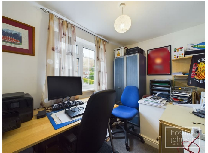
Bedroom 4 10'2" x 6'10" (3.12 x 2.10)

Double glazed window to front, radiator.