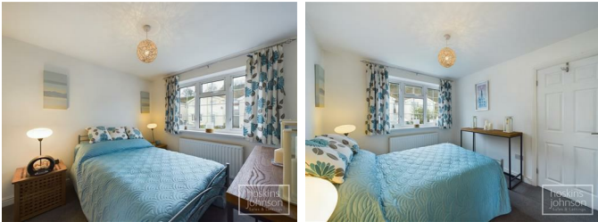
Bedroom 2 10'8" x 9'4" (3.27 x 2.86)

Double glazed window to front, radiator, built in double wardrobe.