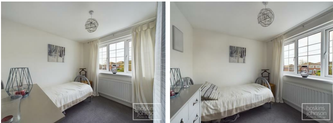
Bedroom 3 10'1" x 8'10" (3.09 x 2.70)

Double glazed window to rear, radiator, built in double wardrobe.