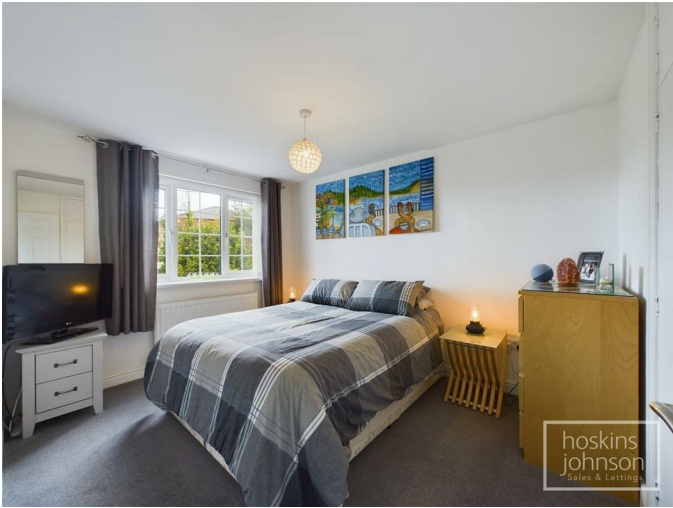
Bedroom 1 11'10" x 9'4" (3.61 x 2.87)

Double glazed window to rear, radiator, built in double wardrobe.