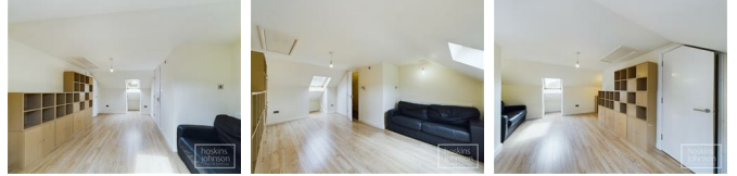
Master Suite 16'11" x 9'5" (5.17 x 2.88)

Skylights to front and rear, radiator, laminated wood flooring, storage cupboards.