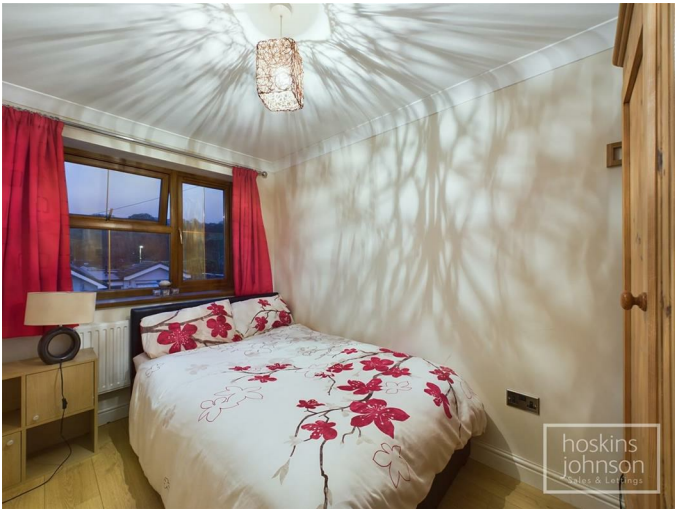
Bedroom 4 11'0" x 7'2" (3.36 x 2.19)

Double glazed window to front, radiator, coved ceiling, laminated wood flooring.