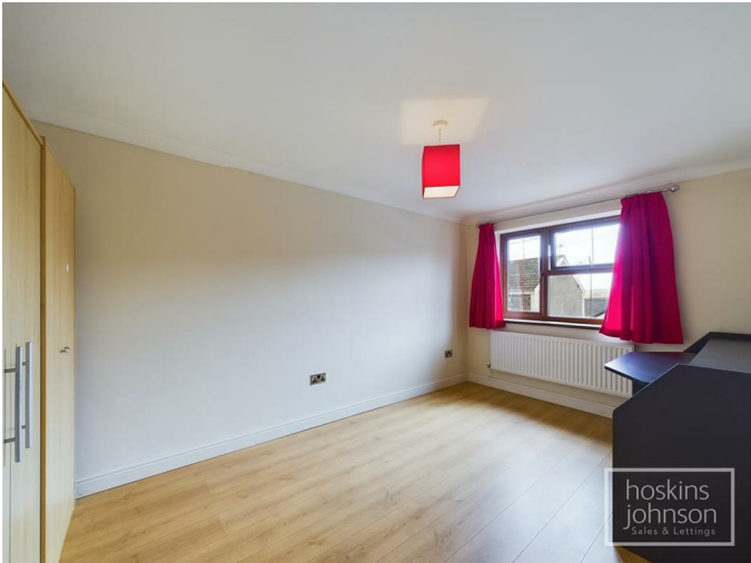
Bedroom 3 14'7" x 8'7" (4.45 x 2.62)

Double glazed window to front, radiator, coved ceiling, laminated wood flooring.