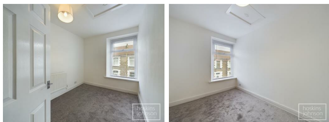
Double glazed window to front, radiator, attic access.