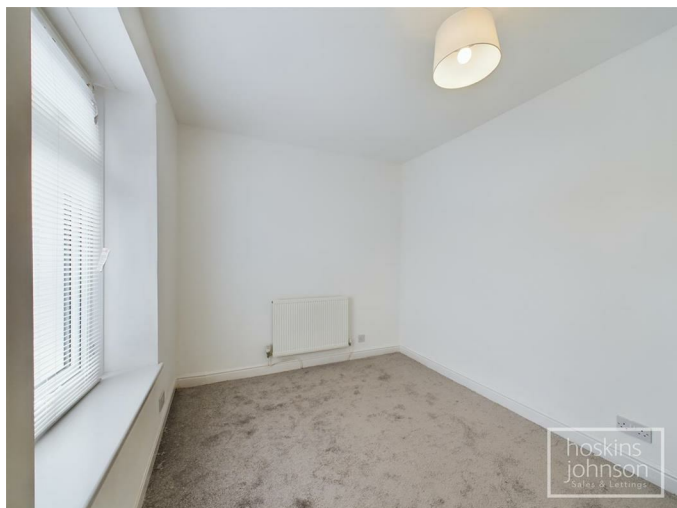
Double glazed window to rear, radiator.