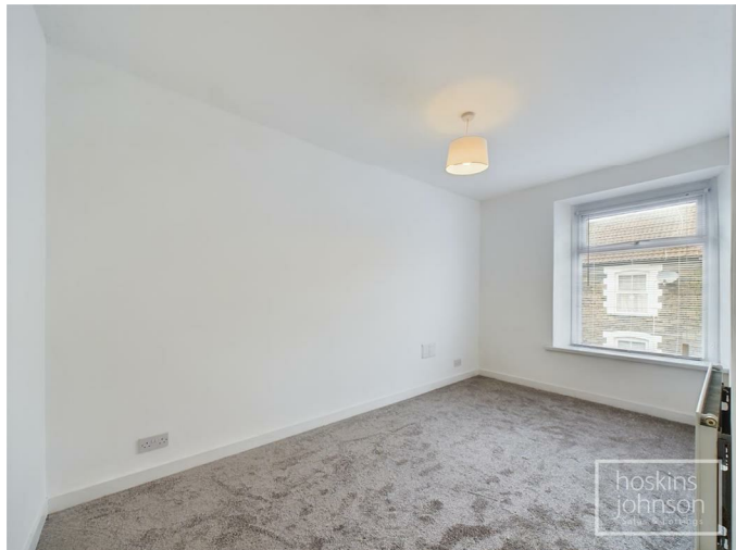
Double glazed window to front, radiator.