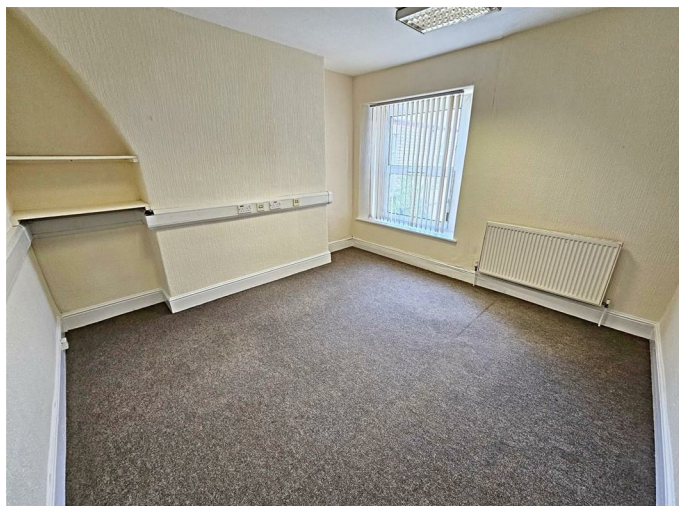
Double glazed window overlooking Morgan Street, radiator.