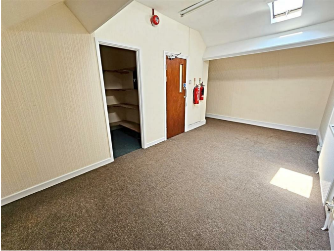
Store Room 1 18'11" x 9'2" (5.77 x 2.80)

Skylights to front and rear, radiator, access to second store room.