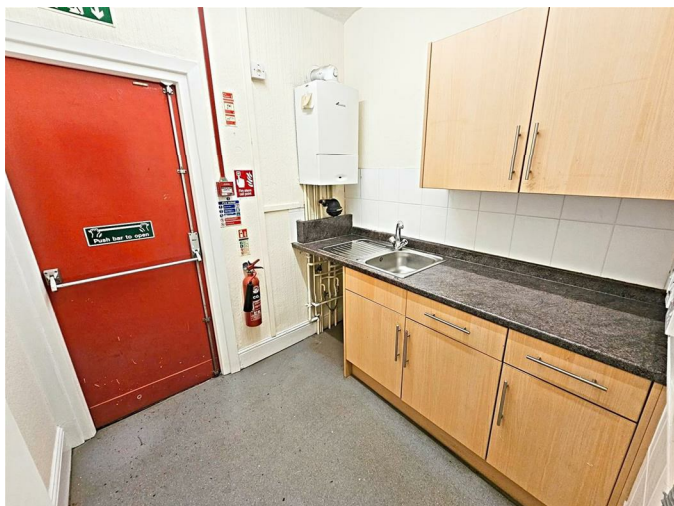
Stainless steel sink unit, base and wall cupboards, wall mounted gas combi boiler, radiator, fire exit staircase giving access to Morgan Street.