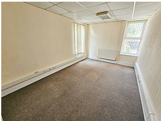
Double glazed windows to side and overlooking Morgan Street, radiator.