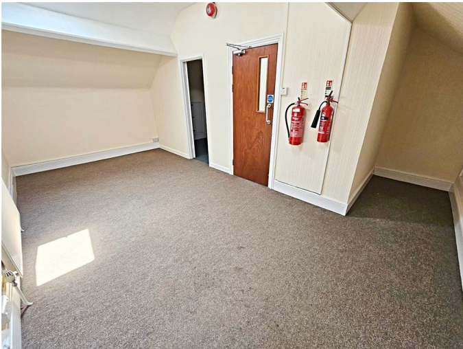
Store Room 2 8'9" x 5'5" (2.68 x 1.66)

Skylights to front and rear, radiator, access to second store room.