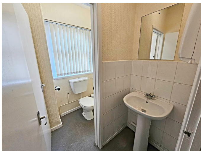
WC, wash hand basin, part tiled walls, extractor fan.