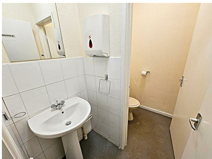
WC, wash hand basin, part tiled walls, double glazed window to side.