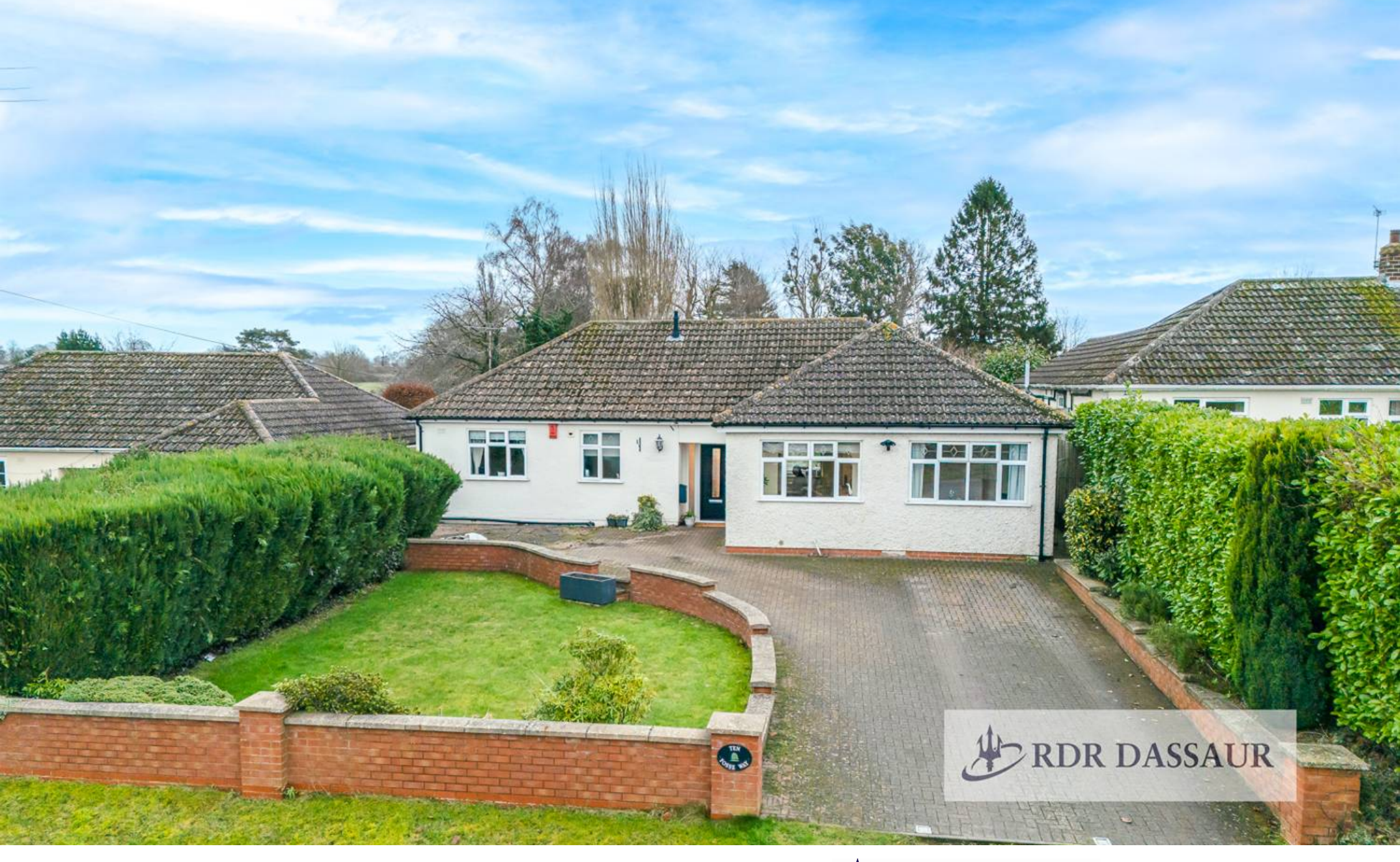
10 Fosse Way, Stretton On Dunsmore Rugby