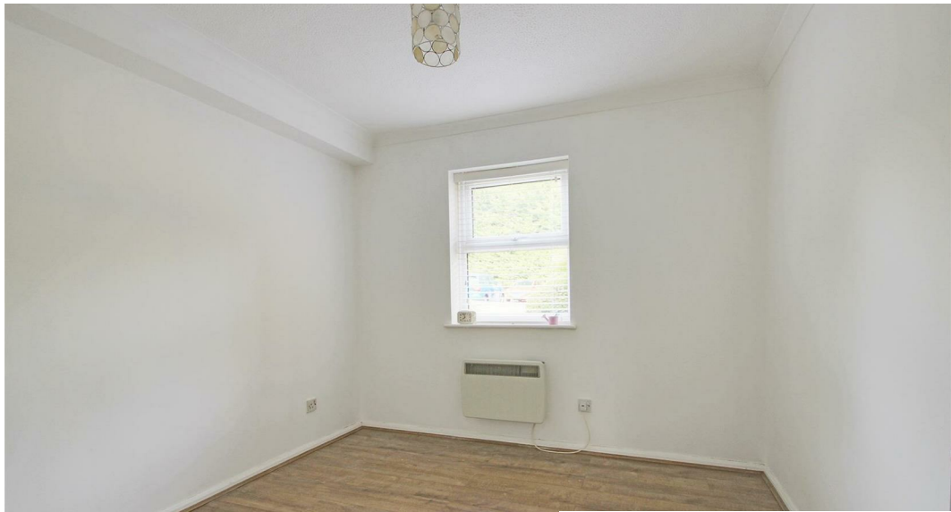
A well presented one bedroom ground floor property with no upper chain