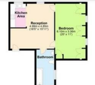
flat 5 45 High Street KL.jpg